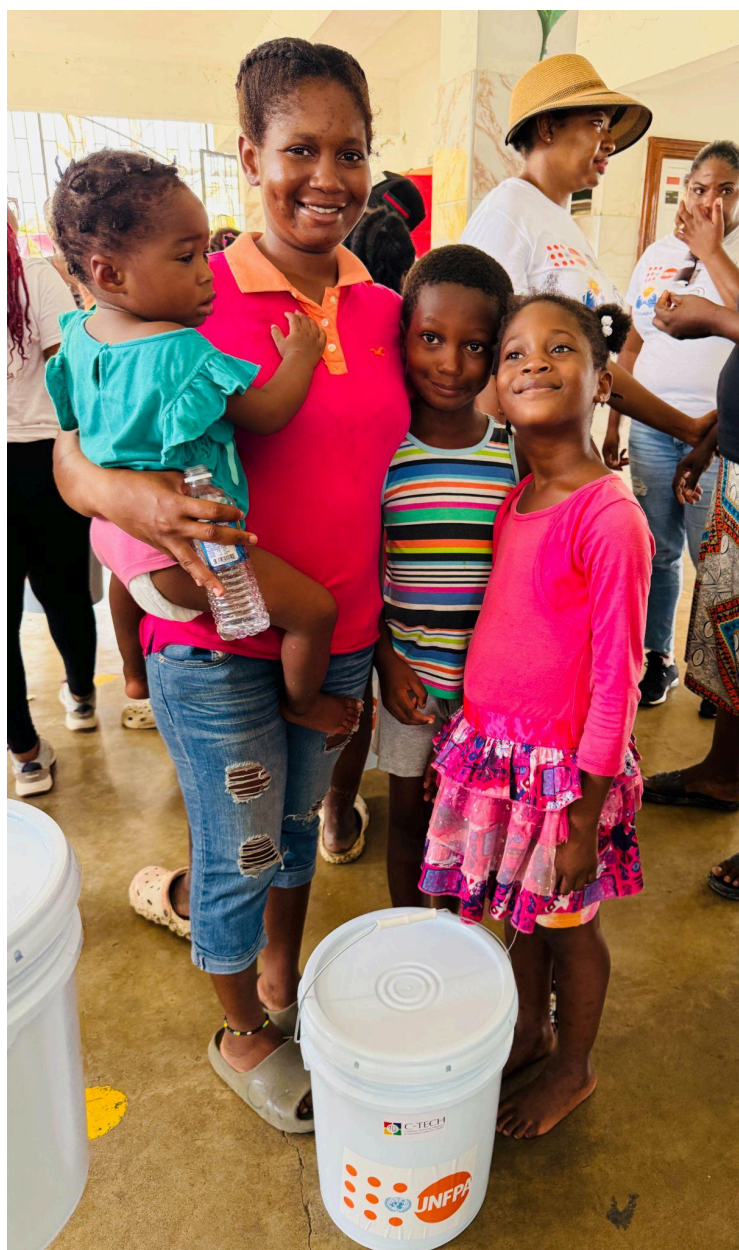
Women received dignity kits, which contain hygiene supplies such as soap, washing detergent, sanitary pads, and other essential items.

A GBViE Specialist from the UNFPA Global Emergency Response Team was deployed to Jamaica to support the scale-up of the GBV response and reinforce emergency operations. The Specialist is providing technical assistance to implementing partners, and strengthening GBV response systems.