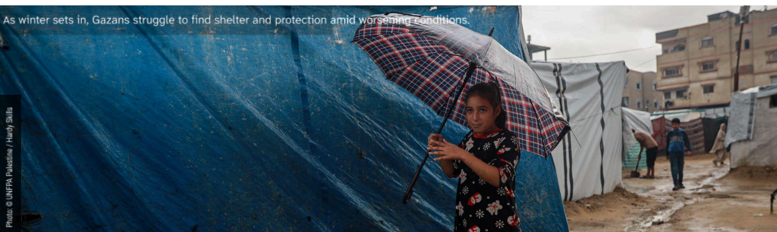
As winter sets in, Gazans struggle to find shelter and protection amid worsening conditions.

The situation in the West Bank remains deeply unstable. Ongoing military operations, record levels of settler violence, and punitive movement restrictions continue to disrupt access to schools, workplaces, markets, and healthcare—including for an estimated 73,000 pregnant women . Humanitarian needs are rising, and restrictions are further complicating relief operations. As of September, only 42% of health facilities were fully functional. Around 232,000 women and girls , including 14,800 pregnant women , have limited access to reproductive health services due to the escalation of violence, particularly in Jenin, Tulkarem, and Tubas governorates.