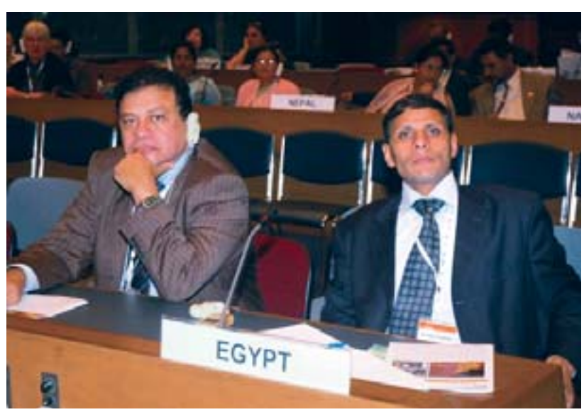
Parliamentarians from Egypt listen to the proceedings in the plenary.

4. Strengthen cooperation and sharing of knowledge and experiences between parliamentarians at regional and national levels.