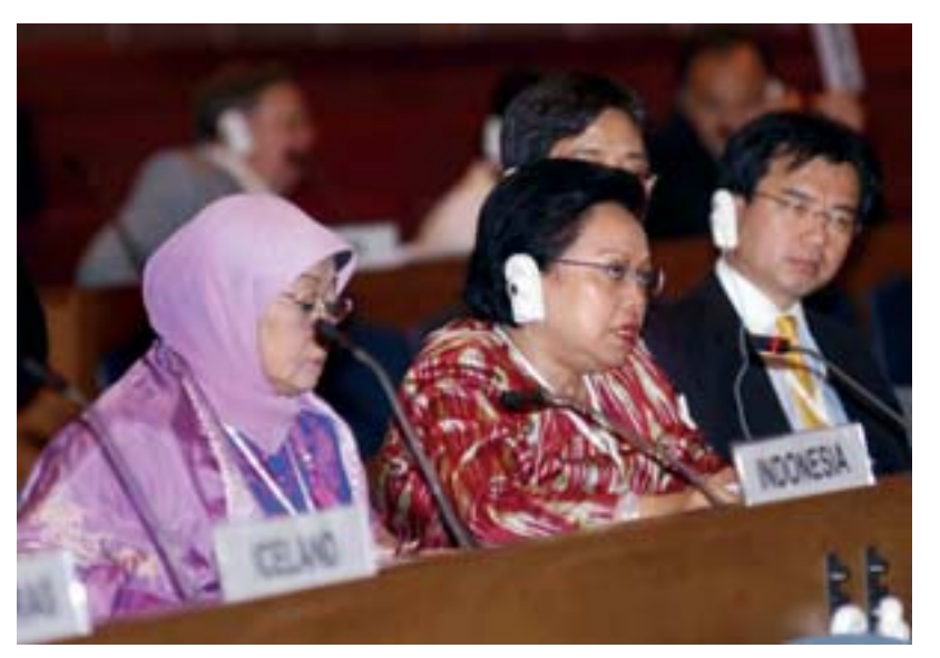
Parliamentarian from Indonesia speaks during the plenary.