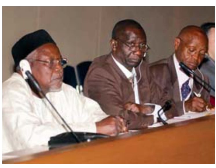
Parliamentarians from Africa engaged in a group discussion.