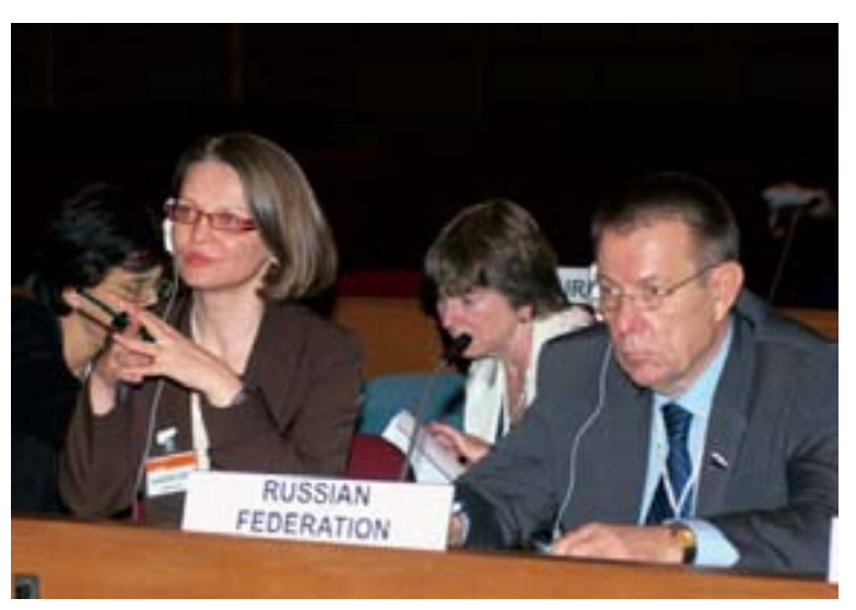
Parliamentarians listen to the proceedings during the plenary.

1. Focus on issues such as brain drain, trafficking, migrant workers (illegal), gender-based violence, and prevention of STDs;