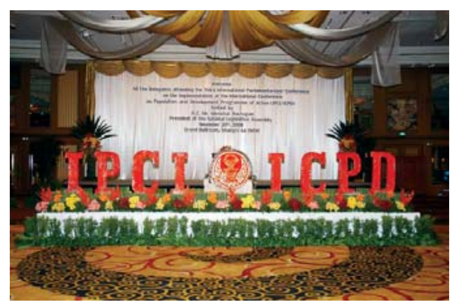
Backdrop of the IPCI/ICPD reception area.

be achieved if questions of population, reproductive health and sustainable development are not squarely addressed through greater investment in education and health, and the prevention of preventable deaths among women.