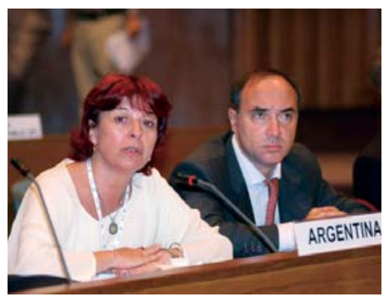
Parliamentarian from Argentina speaks during the plenary.

strengthened and some countries show an important level of macroeconomic growth. However, the region is characterized by disparities, inequalities and social exclusion. The inequality is associated with income distribution and access to productive assets and is reflected in significant differences in the social and economic situation of ethnic groups, women, young people, the elderly and other vulnerable groups. There are also significant gaps of development between and within countries in the region;