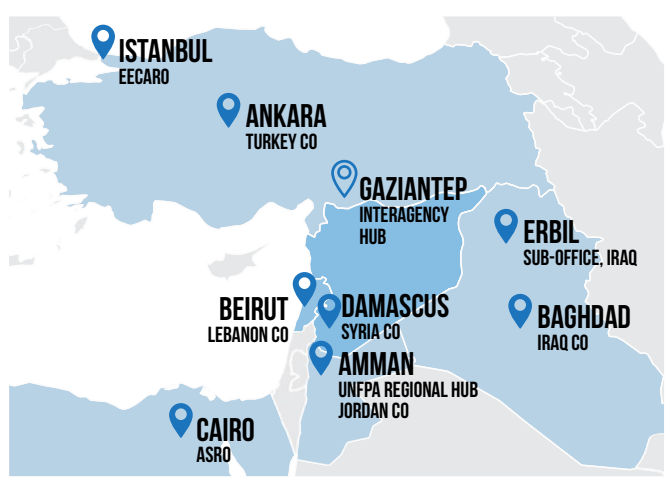
UNFPA Syria response: regional offices, country offices and hub, and Turkey inter-agency hub

The conflict in Syria, now in its eighth year, has had a profound effect across the region. By the end of 2017, 13.1 million Syrian women, men, girls and boys were in need of humanitarian assistance, 6.1 million within Syria and 7 million in surrounding countries. Close to three million people inside Syria are in besieged and hard-to-reach areas, exposed to grave protection violations.